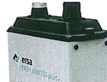
Long-life and robust metal housings for industrial use