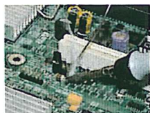
Solder fumes are known to be a big risk to health

A very low noise level is another feature of this filter unit. Silent operation in a robust metallic case allows running the system in basically all industrial surroundings from electronic production to testing floor and laboratories.