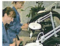
Very silent operation - for all environments