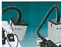
Arm extraction is most efficient and flexible