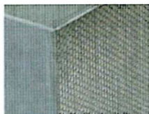
Filtration of particles and gases is a must