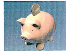
Remote control generates filter and energy savings